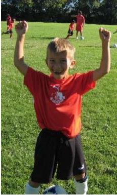
Sacramento United Training Gear

“THIS WOULD BE A REALLY BIG HELP IN MAKING THE ACADEMY SESSION RUN SMOOTHLY”